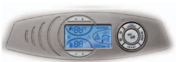
Panel for PEGASUS D range